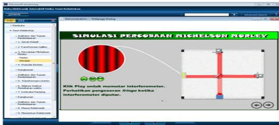
FIGURE 2. E-Book Page Example of Michelson-Morley Experimental Simulation

improving the test scores, improve the students' attitudes, improve the readiness for direct practice, and strengthen the conceptual knowledge [23]. For further understanding, it was provided an interactive exercise such as changes in particle size when the particle moves closer to the speed of light.