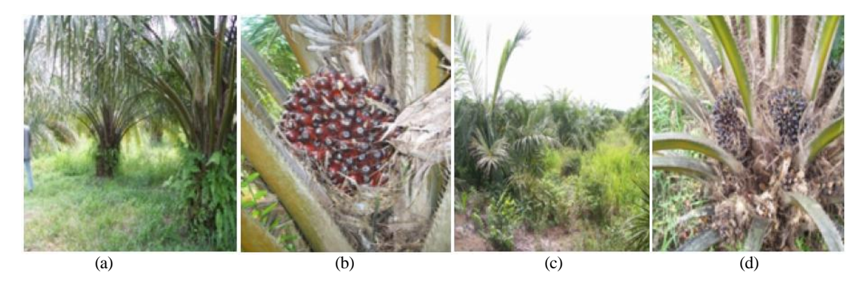
Figure 3. The appearance of oil palm plants and their fruits: (a) and (b) in the IFSCO field; (c) and (d) in the non-IFSCO field.

The results of soil physical and chemical analyses showed that the quality of the soil in the IFSCO field is in general better than that in the non-IFSCO field. This result is supported by the fact that the appearance of oil palm plants in the IFSCO field is better than that in the non-IFSCO field, which