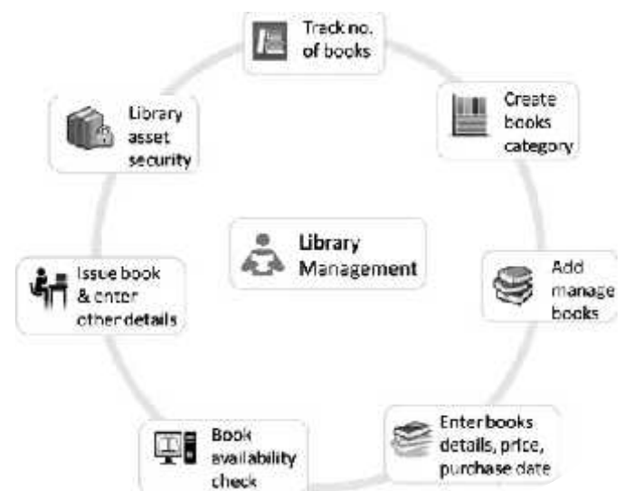
Fig 1. Library Automation and Management System [2]

Automation of the library helps take some of the workload off of librarians and other staff members in the areas of acquisitions, cataloging and circulation, which in turn allows them to better serve their patrons. This extra time can lead to more programs being facilitated in the library and make library staff available to answer reference questions and help people who having trouble researching or finding the right information [2].