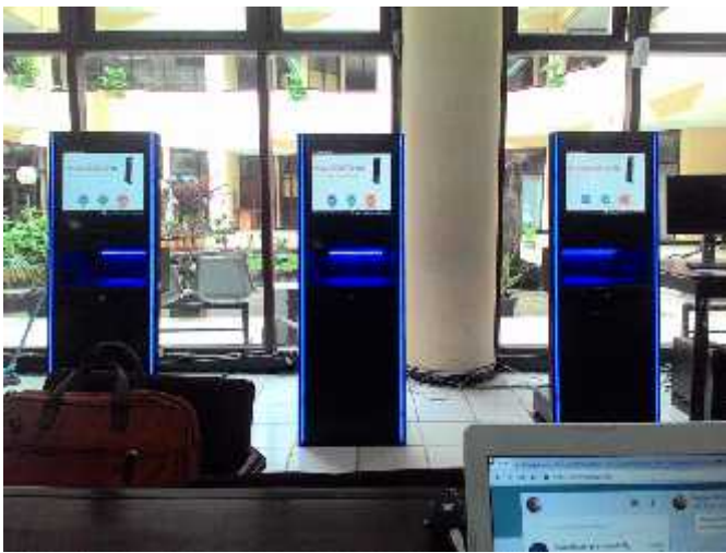
Fig 4. RFID Kiosk

The RFID system tags may contain only an identification number or they may contain considerable additional information, some of which may be permanent and some capable of being rewritten. The 74 bit tag used by Tagsys and the 95 bit tag used by Checkpoint can accommodate only identification, the 256 bit tag used by 3M can accommodate a small amount of additional information, and the 1024 bit used by Bibliotheca and Libramation can accommodate considerable additional information.