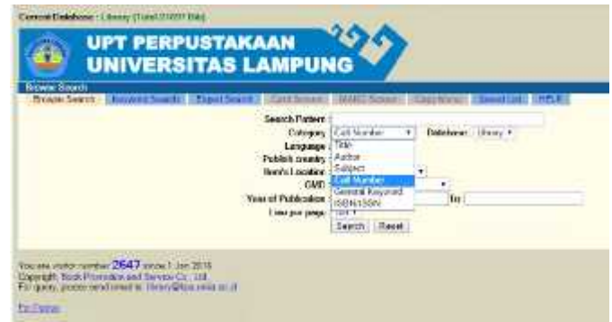
Fig 3. ELIB search module

ELIB is a library automation system to support Bibliotheca RFID library devices. The system support general activities in library automation system. By supporting RFID devices which connect from SIP2 protocol, ELIB can help to automate transaction through Self Service Kiosk, scanning collection, etc. One of the main draw of using ELIB is the developer is a subsidiary of Bibliotheca company which support SIP2 Protocol enabling the use of library automation devices.