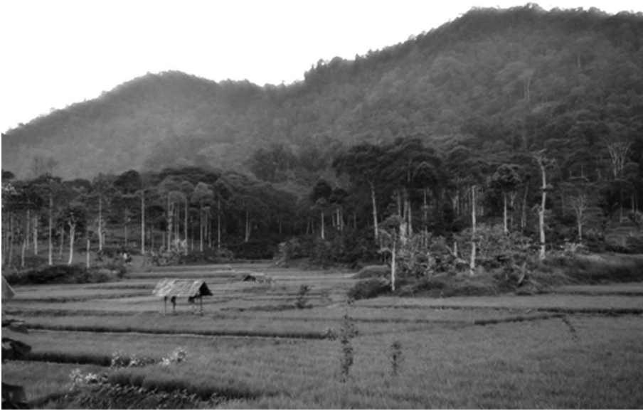
FIGURE A11-3: Border between paddy fields and a community forest within an area of protected forest in West Lampung district.