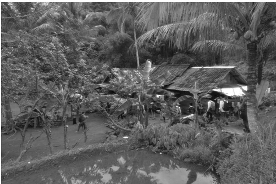
FIGURE A11-4: Kubu Perahu village or enclave in Bukit Barisan Selatan National Park, Lampung province.