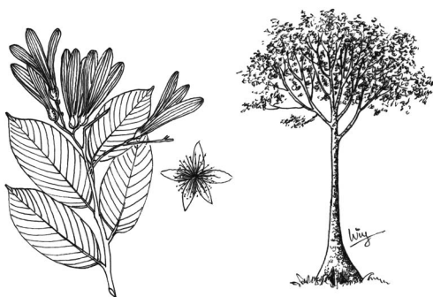
Shorea ovalis Blume [Dipterocarpaceae]

Government community-empowerment programmes aim to improve community welfare around the forest and, at the same time, enlist community help in conserving forest resources. One such programme is associated with the practice of