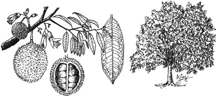
Durio zibethinus L. [Malvaceae]

HKm is defined as state forest that is primarily intended to empower a community, and HD is state forest that is managed by a village and used for the village's welfare. As well as these two schemes there is also what is known as 'the partnership' – a cooperative