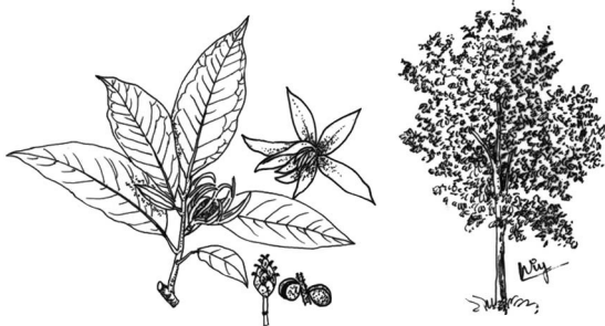
Magnolia champaca (L.) Baill. ex Pierre [Magnoliaceae]

cacao were grown in swidden fields. These plants were used as a source of cash income, and if they were successful, then the shifting cultivation system would be reformed towards settled agriculture. According to Mulyoutami et al. (2010), shifting cultivation systems in Indonesia have transformed into three models: