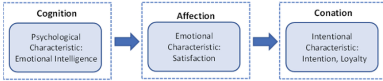
Fig. 1. Cognition-Affection-Conation Framework