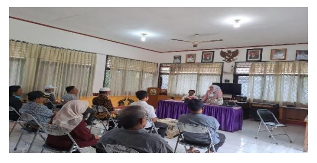
Fig. 3. FGD with informants from community leaders, civil servants, the Covid task force and elements of the Panjang sub-district and sub-district government