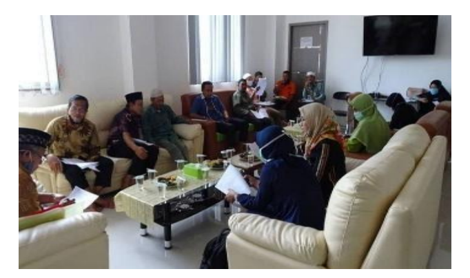
Fig. 4. FGD during data confirmation at the Panjang District meeting hall