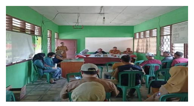
Fig. 2. FGD with poor community components in Karang Maritim sub-district

Furthermore, to produce valid conclusions, data wetness techniques are carried out by carrying out source triangulation, technical triangulation and time triangulation (Sugiyono, 2014).