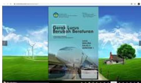
Fig 2. Display of E-Worksheet

Next is the design stage. At this stage, an inquiry-based learning sequence-based e-worksheet design contains several activities. An inquiry-based learning sequence-based e-worksheet was made with the help of Microsoft PowerPoint and Corel Draw applications to design the cover and layout. Then, the finished e-worksheet design is compiled in Flip PDF Professional.