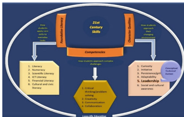
Fig. 1. The leadership skill.

21st-century skills are internationally categorized is required to i.e., critical thinking and problem solving, creativity, communication, and collaboration [55]. In addition, 21st century skills are characterized by the rapid development of technology and information,