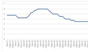
Fig. 2. Interest Rate Movement in Indonesia, 2017:M1–2021:M12.

34 according to this theory have a negative relationship. Interest rates affect the present value of the firm's cash flow. The higher the interest rate will make the investment opportunity unattractive anymore. When the interest rate rises, companies that rely heavily on interest-based capital will experience a rise in their cost of capital and a decline in their net income. Following a decline in net income, earnings per share (EPS) will decline, resulting in a decline in share price. Investors avoid low-yielding equities because of this tendency. Companies that rely on capital from the issuance of shares are also affected by the increase in interest rates because they must provide investors with minimal returns in accordance with the interest rate plus a risk premium. This will increase the company's cost of capital, decreasing the stock price and contributing to the stock index's drop. Research by [6] The impact of interest rates on the LQ45 stock index is notably negative.