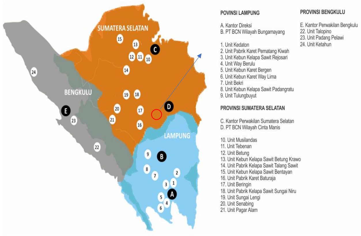
FIGURE 1. Location Map (PTPN 7. Com/Petasetatis)

The data analysis carried out in this study is to compare the comparison of the availability of water in the reservoir for use in the palm oil processing process in the factory before and after revitalization of the existing ponds. The analysis of data include : maximum rainfall analysis, ground water discharge analysis, potential evapotranspiration, run off, and conductivity of soil in ponds.