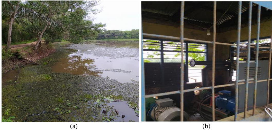
FIGURE 3. (a) One of pond location where silting occurs due to sedimentation. (b) The water pump used to drain water from the pond to factory.

From several literature studies, the water demand for palm oil processing in the mill is based on actual data in the field. However, several previous studies have analyzed the need for water use carried out at each stage of the implementation of oil palm processing [8]. However, the amount of water consumption used for palm oil processing in this study will be assessed based on secondary data released by the processing plant to be studied, namely the Bekri Business Unit palm processing plant.