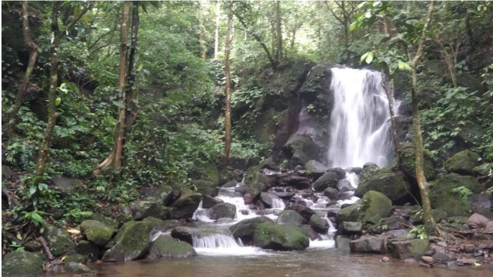
Figure 2. Anakan Waterfall