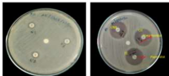
Fig. 2 – Diffusion test results showed resistant (left) and sensitive (right). ENR=enrofloxacin; OT=oxytetracycline; TE=tetracycline.

Results of A. hydrophila disc test were resistant and sensitive (Fig.2) to antibiotics. Measurement of the inhibition zone of the antimicrobial sensitivity test based on Clinical and Laboratory Standards Institute reference (CLSI, 2018), where for tetracycline and oxytetracycline antibiotics have a diameter of \leq 11 mm (resistant), 12-14 mm (intermediate), and \geq 15 mm (sensitive). Then for this type of antibiotic enrofloxacin has a diameter \leq 15 mm (resistant), 16-20 mm (intermediate), and \geq 21 mm (sensitive). Test results from diffusion test on 31 isolates of A. hydrophila isolates showed that two isolates were resistant to oxytetracycline, one isolate was resistant to tetracycline, and none was resistant to enrofloxacin (Fig.3).