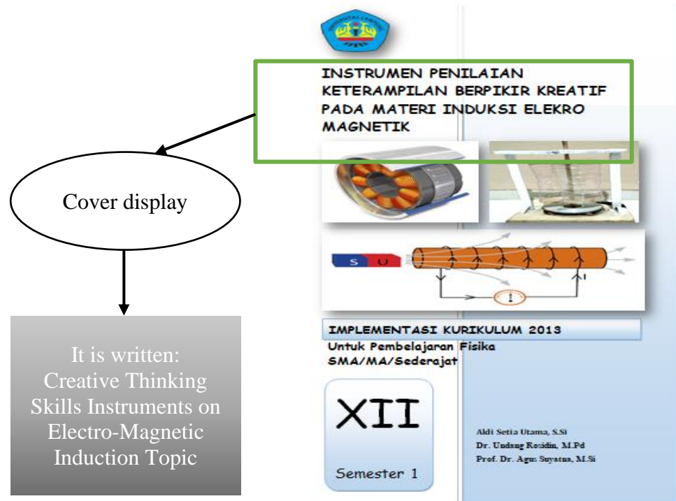
Figure 2. Cover

The instrument design contains core competencies, basic competencies, and indicators of creative thinking skills and PjBL steps. As shown in Figure 3.