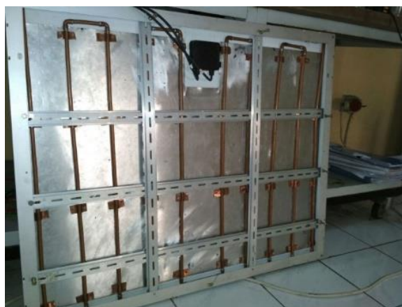
Fig. 1: PV/T collector

The collector must be tested under incident radiation more than 500\text{ W/m}^2 . Data collection were recorded for inlet and outlet fluid temperatures, ambient temperature and incident radiation, respectively. Then, the temperatures and radiation were measured using K-type Thermocouples and Solar Power Meter SPM 1116SD, respectively. According to EN 12975-2 standard, the mass flow rate of the working fluid was regulated by using a valve at a constant flow rate of 0.02\text{ kg/m}^2\text{s} . Electrical heaters were used in order to vary inlet fluid temperatures during the tests.