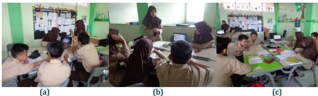
Figure 2. Argumentation Interactive Session in the Experiment Class (a)-(c) Group 2-4

In interactive argumentation session syntax, students carry out group discussions by visiting and receiving guests. The interaction between each group's arguments was recorded in audio form and each question asked from the guest along with the answers given from the presenter group were written. This can be seen in Figure 2 and Figure 3 .