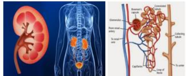
Fig. 2. Kidney and nephron.

Your body consists of many systems that work, one of which is an excretion system. The excretion system is responsible for removing metabolic waste in the form of urea and ammonia. The excretion system is composed of several organs. One of the constituent organs of the excretory system is the kidneys. Every human has a pair of kidneys, left and right kidneys, which are located in the waist region. Kidney has a function to form urine through various stages that occur in the kidney nephron. These stages start from filtering the blood, absorbing what is needed, and finally becoming urine. The kidneys excrete urea and ammonia through urine.