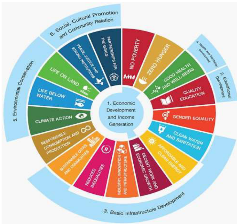
Figure 2 Circular e-learning in public (see online version for colours)