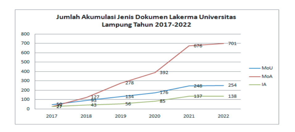
Figure 1: Unila Cooperation Document Graphic.

and teaching, the University of Lampung also places the implementation of the lecture curriculum based on the Merdeka Campus – Merdeka Learning (MBKM) as a strategic issue in the Strategic Plan for 2020-2024.