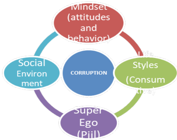
Graphic 3: Sociological Factor of Regional Head Corruption in Lampung Province

The organizational circumstances can also influence someone to corrupt. We see that anyone can be involved in corruption, both superiors and subordinates. If a leader does not have exemplary and integrity, this can be imitated by his subordinates. Corruption in Lampung is an interesting phenomenon because several regional heads have been caught doing corruption through OTT by the KPK. This corruption is not only created by corporations and DPRD members, but also by bureaucracy. We can see in graphic 3.