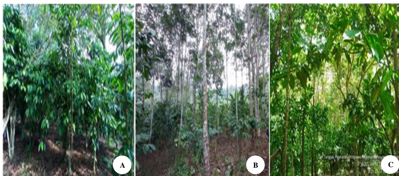
Figure 2. A. Combination of coffee ( Coffea arabica ), Senna siamea (johar), Dalbergia latifolia (sonokeling), and pepper ( Piper nigrum ). B. The combination of rubber ( Hevea brasiliensis ), coffee ( Coffea arabica ), and Aleurites molucana (kemiri). C. Combination of rubber ( Hevea brasiliensis ), coffee ( Coffea arabica ), Pithecellobium lobatum (jengkol), Myristica fragrans (pala)