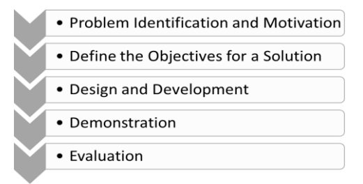
Figure 1. Design Science Research Methodology (DSRM) Process Model