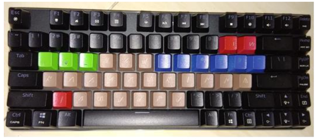
Figure 5. Prototype Lampung Alphabet Keyboard

Implementation results on the keyboard prototype can be seen in figure 5: