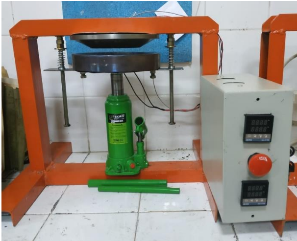
Figure 3. Leaf Plate Molding Machine

The machine is developed since 2017 for producing leaf plate. It is a manual machine that can be easily replicated for scale up purposes. The machine using a hot press molding to mold the tebakak leaf into plates[17]. It is using two 350-watt heating elements. The temperature is controlled using a PID controller (Proportional Integral and Derivative controller) to achieve 1-degree accuracy. The accuracy is needed as a charred leaf plate is not desirable. Below shown the leaf plate molding machine.