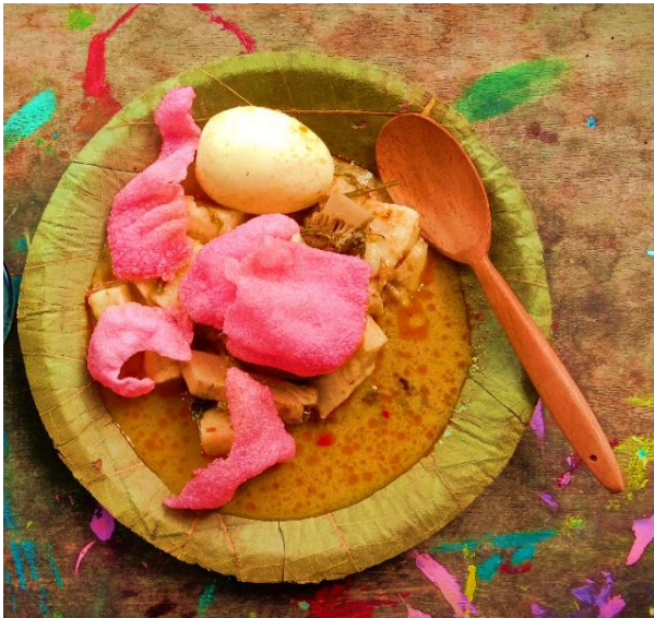
Figure 2. Tebakak leaf plate used to serve lontong sayur a local delicacy

production is quite easy and economical because it only changes the shape of the leaves to follow the shape of the plate. The tebakak leaf plate has the integrity of the leaf structure so that the strength and characteristics of the leaves are maintained. The leaf plate has a diameter of 22 cm with a plate indentation depth of about 3 cm and is able to accommodate relatively large amounts of food (357 grams). Tebakak leaves are hot molded processed with natural adhesives from starch so they are more durable. Tebakak leaf plates can be stored for more than 6 months.