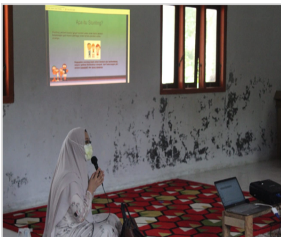
Picture 2. The Health Promotion

Targeted health education will have an impact on comprehensive prevention (5 levels of prevention) and increase knowledge on health and improve public health status. 12 Methods that can be used in providing health education are lecture methods, group discussions, brainstorming, panels, play roles, demonstrations, symposia, seminars in a community or group as well as guidance and counseling for an individual. 13