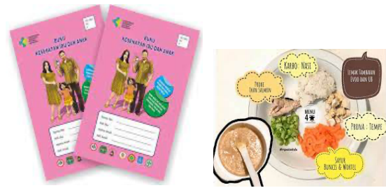
Picture 3. Assessment Instruments for Growth and Development and Foods for Babies/Toddlers