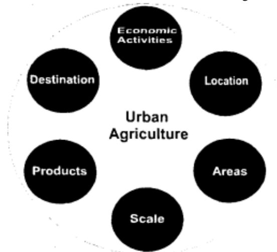
Figure 2. Dimensions of Urban Agriculture or Urban Farming

Food security in activitiesurban farmingcan be easily realized due to the close distance between producers and consumers, so that it can help food availability for households. The dimensions of Urban farming / urban agriculture are as follows: