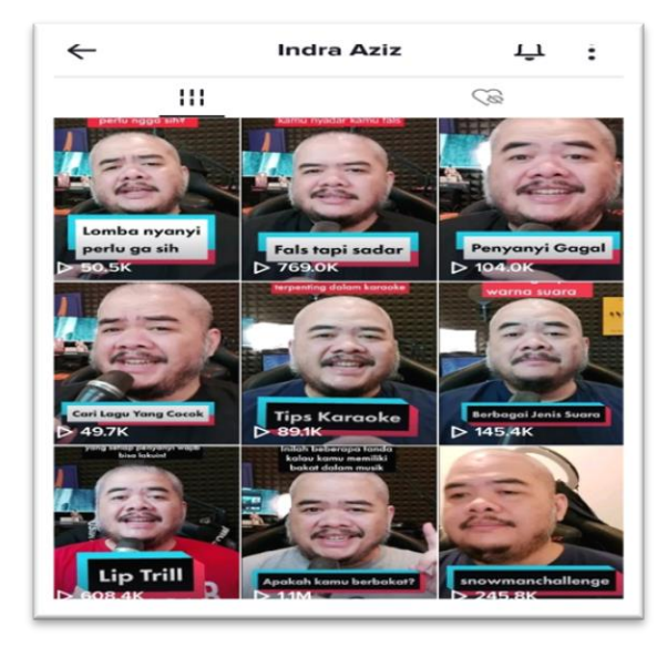
Figure 2. A good TikTok account for music learning has concept and consistency