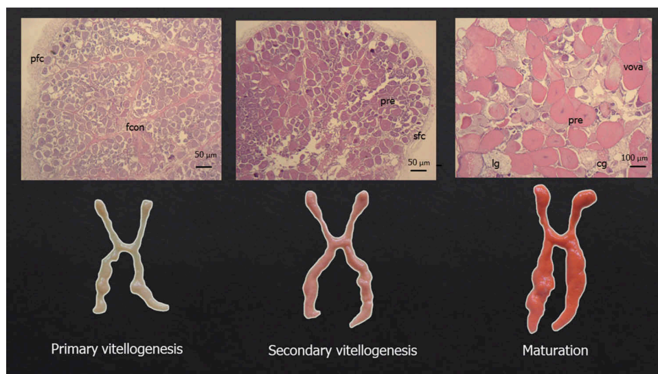
Figure 1. Oogenesis stages of spiny lobster ( Panulirus homarus ) ovaries used in this study. pfc: primary follicular cell; fcon: fibrous connective tissue; sfc: secondary follicular cell; pre: previtellogenic oocyte; lg: lipid globule; vova: vitellogenic oocyte; cg: cortical granule.

Approximately 1 \mu\text{g} of gonad was weighed with microbalance and pyrolysed at 400^{\circ}\text{C} . The products of pyrolysis were analysed by GCMS. Gas Chromatography separations were carried out with a GCMS-QP2010 (Shimadzu, Tokyo) plus instrument equipped with an \text{rt} \times 5 ms capillary column (length of 60 cm, diameter of 0.25 mm, and thickness of 0.25\mu\text{m} ). Chromatographic separation was achieved by the following temperature program: 50^{\circ}\text{C} for 5 min, then it was raised to 280^{\circ}\text{C} for 50 min with pressure of 101 kPa. Helium was the carrier gas at 0.85 mL/min with total flow of 46.5 mL/min and flow program mode at a linear velocity of 23.7 cm/sec, and purge flow of 3.0 mL/min. Split injection mode used was the ratio of 1:50. Mass spectra was set with ion source at 200^{\circ}\text{C} and interface at 280^{\circ}\text{C} with solvent cut time of 1.5 min. Detector temperature used was 280^{\circ}\text{C} and compound identification was based on comparison of mass spectra with WILEY7 library database. Compounds with the highest similarity ( >90\% ) were identified as steroid hormones and fatty acids data were selected from five ranks of compounds similarity available from library database.