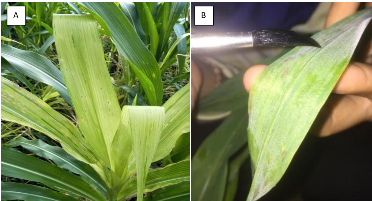
Fig. 1. The symptom of downy mildew disease: (A) leaf chlorosis, (B) conidia layer fungi with white color like powder on leaf surface

The occurrence of downy mildew disease is the percentage of sick plant compared to all observed plants in a certain area. The Trichoderma spp. fungi treatment as biofungicide and plant resistance inducer affected in reducing the downy mildew disease occurrence at 4 and 5 days after inoculation (DAI) (Table 4).