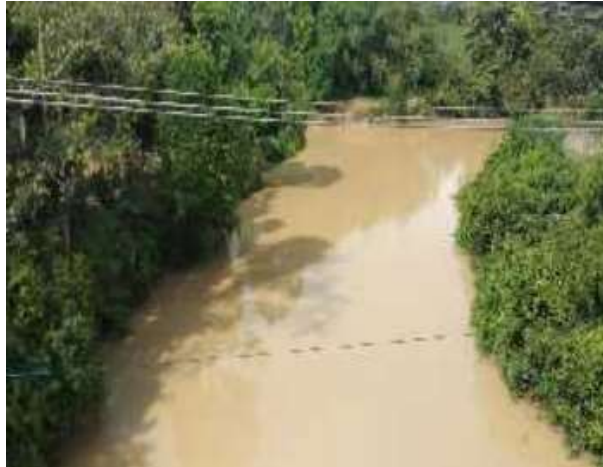
Fig 4. The river physical water quality performance of Way Pengubuan.