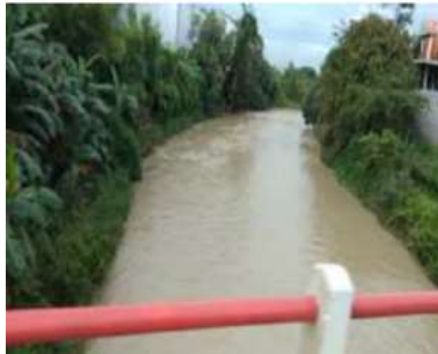
Fig 2. The river physical water quality performance of Way Bulok

Discharge is the rate of water flow (in the form of water volume) passing through a cross section of the river per unit time [23]. This data is valuable information for planning a water resource management activity in a watershed area [24]. As for describing the physical performance of water quality as discharge, in Fig 2, Fig 3 dan Fig 4. presents photos of water flow from 3 sub-watersheds. The severest in sediment contend is at Way Pengubuan river, the lowest is in Way Bulok River. It seem correlated with its forested covering each sub-watershed namely 2.12% (Table 4), 4.84% (Table 5) , and 0.83% (Table 6) for Way Besai, Way Bulok, and Way Pengubuan respectively. Table 3 depicts the average of river discharge at the three sub-watershed.