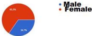
Fig. 1. Respondent Genders

The results of this demographic analysis are an explanation of the results of the questionnaire based on gender, faculty, class, and whether the respondent has a background in the IT (Information Technology) field or not.