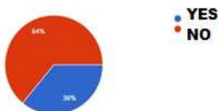
Fig. 3. Are you in IT Background?

The picture above shows that most of the respondents who filled out this questionnaire were from the 2019 class with a percentage of 52% or as many as 39 people. Meanwhile, there were only a few respondents, namely the class of 2021 with a percentage of 6.7% or just 5 people