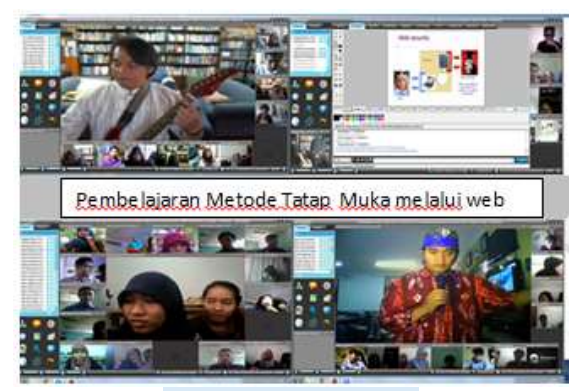
Figure 2. face to face meeting

In the blended learning research, we used pdf learning material, games link (Fig. 3) and virtual face to face meeting link (Fig. 2) that were saved in the class website. The website page on the first picture was made to show the face to face meeting information where the students can interact directly with the lecturer, while on the second picture we can see the website link for coding lesson material in the form of games.