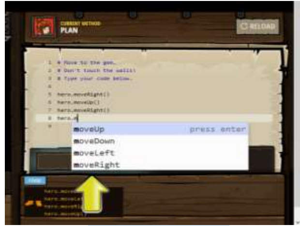
Figure 3. website link for coding

We did a test of normality to compare the first variable (using blended learning method) with the second variable (using conventional learning method). We believe that using both variables represent the development of information and communication technology at the moment, so that can be adapted in implementation of conventional learning method which is known without using technology of information and communication to facilitate learning process and improving the performance [4] [7]. During the process of analyzing data that has been done, we used the study result test in using blended learning method (X1) in a 45 students class and using conventional learning method (X2) in a 40 students class.