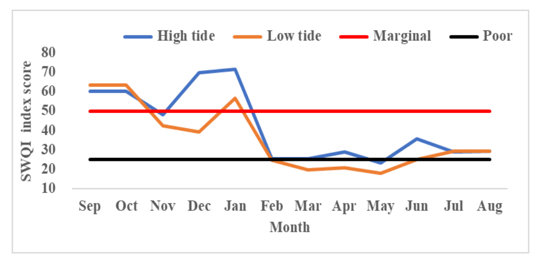
Figure 3. Temporally, water quality status calculated by SWQI in Lake Siombak.

creating the illusion that the chemicals are more significant at high tide. According to Sheela et al (2012) the concentration of dissolved compounds is greater near the bottom than at the surface.