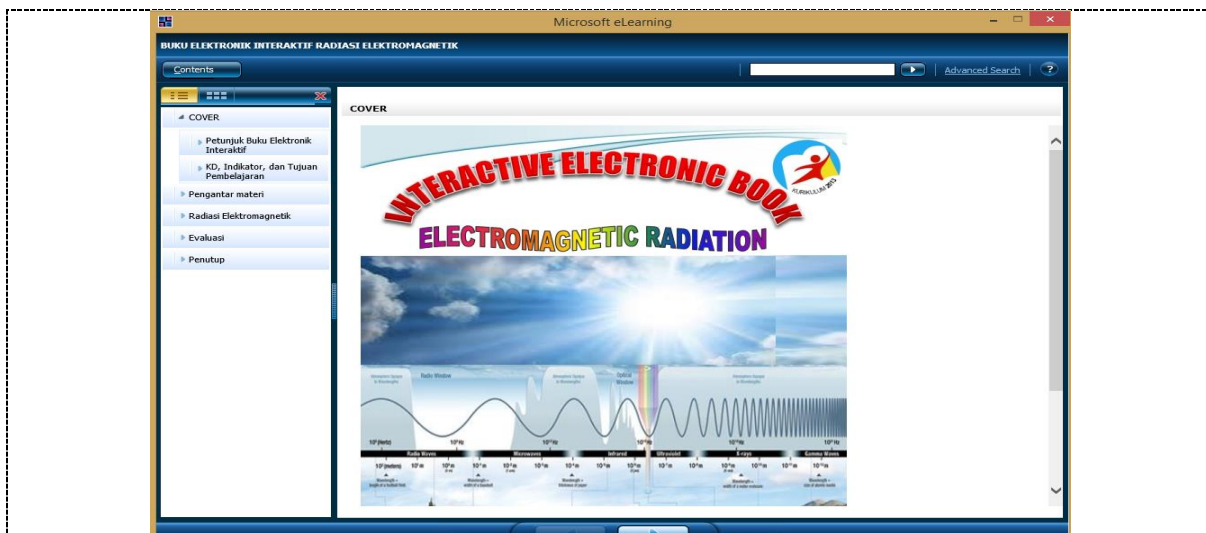
Figure 1 The cover view interactive electronic book on electromagnetic radiation

Development Stage. This stage contains the realization activities of product design that is ready to be implemented. The result of product development carried out at this stage is in the form of prototype I. The interactive electronic book format that will be developed is: the opening chapters that contain the front coverage instructions, study instructions, and content standards ( Figure 1 ) and ( Figure 2 ).