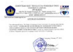
Pengesahan Kepala UPT Bhs.jpg 1687K

hormat saya, dto, Chandra E [Kutipan teks disembunyikan]