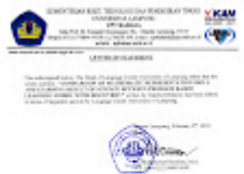
Pengesahan Kepala UPT Bhs.jpg 1687K