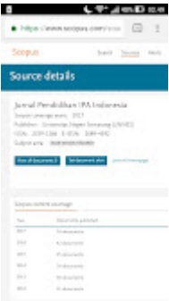
ID Sopus 2012-2015.jpg 194K