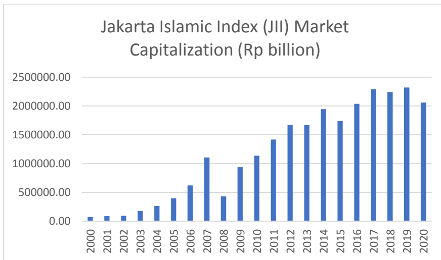
Fig. 1. Jakarta Islamic Index (JII) Market Capitalization Source: https://www.ojk.go.id/ [3]

Fig. 2 shows that although the stock price looks volatile, the graph shows an upward trend. Seeing this and Indonesia itself, which has a majority Muslim population, it is suspected that Ramadan will have a positive impact on the Islamic stock market in Indonesia. Previous research has also shown that Ramadan has a different impact on the market. As research conducted by Hijazi [13] shows that Ramadan has a positive effect on Palestine Exchange