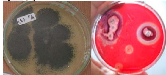
Fig. 1 a.) Colony of A. tubingensis ; b) Plate screening of xylanase by displaying clearing zone (halo).

The xylanase production ability of fungi assessed by estimating zone around the colony formed due to ability of fungal isolates to hydrolyze xylan (Figure-1). Results showed that A. tubingensis enzyme activity indicated by diameter colony is 2.65 cm with the ratio of colony/halo 3.59 (Figure-1b). Screening of xylanolytic fungi is based on the size of the diameter of the clear zone indicating the ability of isolates to hydrolyze xylan [7]