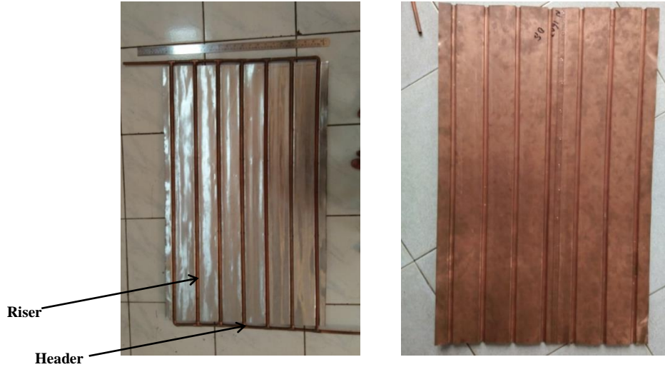
Fig. 1: The tested solar collectors with (a) aluminum absorber plate (b) copper absorber plate