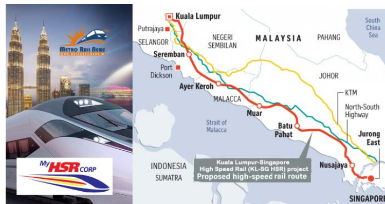
Fig. 5 Proposed Kuala Lumpur – Singapore HSR line [17]

although the relationship has faced some challenges in the past, it has existed since 1965. The Mahathir administration which was in control in Malaysia from 1997 to 2002, was believed by many to be the most stressful period between both Singapore and Malaysia. However, the situation changed after Abdullah Badawi got into power and became the prime minister of Malaysia in 2003, and since then there has been enhanced contact and cooperation between both governments. History is starting to repeat itself again in the part of the SG – KL HSR project [16].