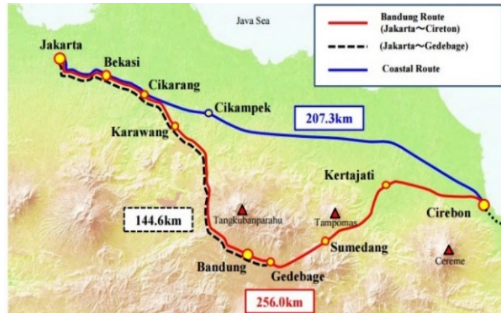
Fig.1 Japanese proposed route [4]

for the government to execute and there were several other more important and significant infrastructural projects that were required in the underdeveloped islands outside of Java.