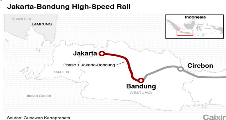
Fig. 2 Route of Jakarta to Bandung HSR [11]