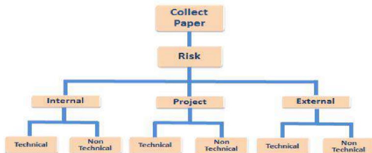
Figure 1. Research Framework

The writing of this article is based on a literature review conducted online including various scientific articles relating to risk analysis on road construction projects, which are then reviewed and synthesized to provide comprehensive information. The research framework of this research of articles is shown in Figure 1 below: