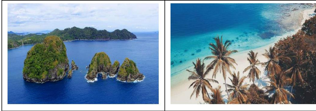
Figure 1. Pulau Wayang and Teluk Hantu – Pesawarn District of Lampung Province

Therefore, this study was conducted to determine any suitable strategy for development of sustainable community based marine ecotourism.