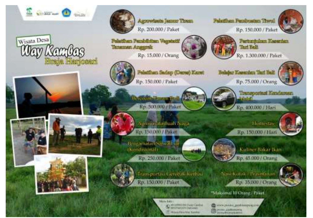
Figure 1. BrajaHarjosari Ecotourism Village tour package

How is the development of an ecotourism village in BrajaHarjosari village which is a buffer zone for TNWK the industrial revolution 4.0 era? from the results of observations and interviews as well as documentation searches, the eco-tourism village manager there has used technology to build an eco-tourism market through digital tourism marketing. PokdarwisDesaBrajaHarjosari promotes and markets tour packages or eco-tourism attractions using digital media, including websites and social media (Instagram, Facebook, Whatapps, and others), online advertising, marketing via electronic mail, online discussions, and smartphone applications. Here is the BrajaHarjosari Way village tour package, which is displayed on their website: