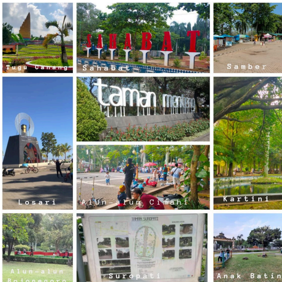
Figure 1. The pictures are Canang Monument in Central Lampung (a), Sahabat Garden in the Regency (b), Samber Field in Metro City (c), Losari Beach, South Sulawesi (d), Kartini Park and Cimahi town square €, Bojonegoro town square (f), Menteng and Surapati Park in Jakarta (g), Anak Batin Gardenin South Lampung Regency (h).

Under the rules of Law No. 26 of 2007 on Spatial Planning, specifically Article 29, paragraph 2, which says that the proportion of Urban Green Space in urban areas UGS must be at least 30% of the city’s total area, local governments are required to create UGS.