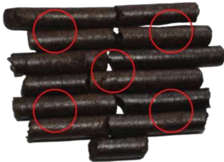
Figure 3. Color change measurement.

\Delta b^* = Change in yellow/blue chromaticity