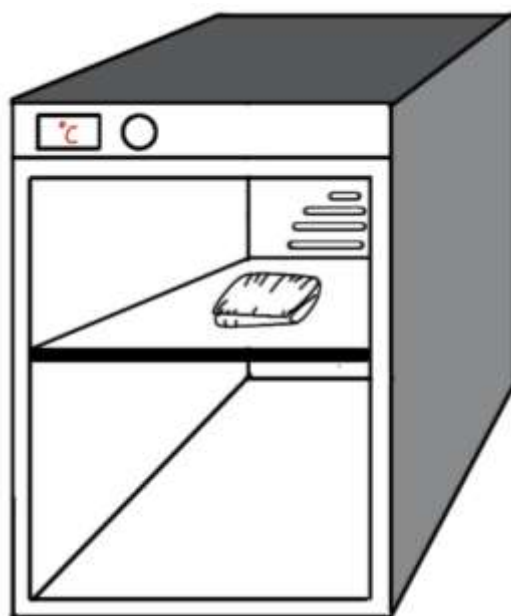
Figure 2. Torrefaction scheme using the oven.

Torrefaction was conducted using an oven (BJPX - Summer, PT. Innotech System, Jakarta, Indonesia) at 200°C, 240°C dan 280°C for 50 minutes in Workshop Forest Products at the Integrated Field Laboratory, Faculty of Agriculture, University of Lampung at 14-17 December 2021. Each torrefaction pellet was prepared as much as 12 bar and wrapped using aluminum foil, then given a little hole on the sides to allow air to escape. The oven was set to a predetermined temperature and added 20°C more degrees because the temperature would decrease after the oven was opened. After the oven reached the predetermined temperature, pellets were put into an oven, set to torrefaction temperature, and then set on the timer. After 50 minutes, pellets were taken out from the oven, cooled at room temperature ranging from 20°C-30°C and covered with a cloth to prevent combustion. The torrefaction scheme presented in Figure 2.