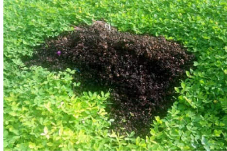
Figure 4. Investigated samples: fruit waste biomass.

Collected CP samples were removed from the raw coffee cherries by using of pulping machine (see figure. 5) directly after harvest and CH samples were collected after the process of green coffee beans natural sun drying (see figure. 6) and removing of skin remains. Thus, CP samples occurred in their initial moisture content, while CH samples were already sundried during drying process.