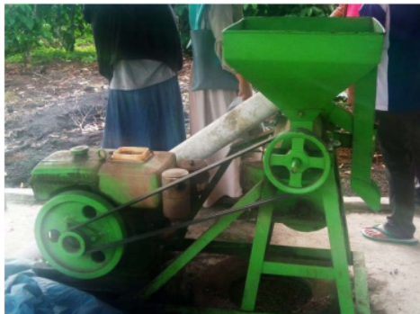
Figure 5. Postharvest treatment equipment: pulping machine.

Collected CP samples were removed from the raw coffee cherries by using of pulping machine (see figure. 5) directly after harvest and CH samples were collected after the process of green coffee beans natural sun drying (see figure. 6) and removing of skin remains. Thus, CP samples occurred in their initial moisture content, while CH samples were already sundried during drying process.