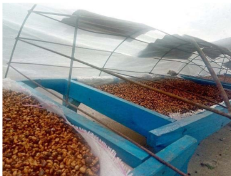
Figure 6. Postharvest treatment equipment: solar sun dryer.