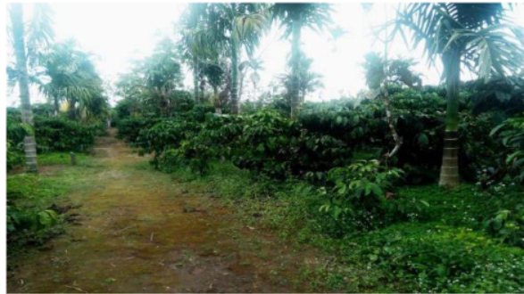
Figure 7. Intercropping principle at target plantation.

Target plantations were cultivated by using of the intercropping principle; an Areca palm ( Areca catechu L.) specie was grown there as an intercrop intended to protect coffee trees against to abundance of sunshine and prevent of the water vaporization [32], see figure 7.