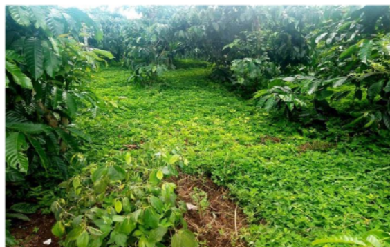
Figure 8. Cover crops principle at target plantation.