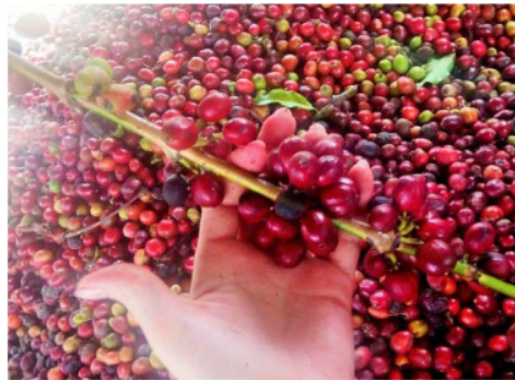
Figure 3. Investigated samples: ripe raw coffee cherries.

Collected samples of fruit waste biomass represented agriculture residue generated within the coffee agroindustry during the raw coffee cherries and green coffee beans treatment. Figure 3 visualizes the harvested unprocessed coffee cherries and figure 4 represents the fruit waste biomass removed from raw coffee cherries in practice in the form of the agriculture residue left behind.