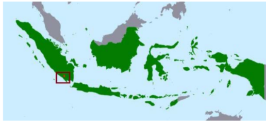
Figure 2. Target area of collection.

Samples were collected during the rainy season in February 2019 at organic shaded coffee plantations placed in mountain areas of Hanakau city, Sukau district, West Lampung Regency, South Sumatra, Republic of Indonesia, as expressed in figure 2.