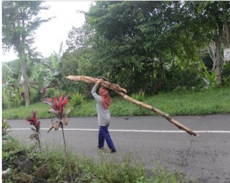
Figure 1. Activities of Collecting Firewood

The community has carried out these activities for a long time. Based on its historical background, people living in the Pesangrahan village have lived in the area for a long time and have been active in the forest area [16]. Since the designation of the area under BTNGR in 1997, the BTNGR has prohibited these activities. So, the community began to use the TNGR area covertly. In 2003, the village communities around the TNGR area were given the opportunity, informally, by the BTNGR officers to utilize grass in the TNGR area as their livestock feed. However, in practice, these utilization activities are not limited to the use of grass but also utilizes the TNGR area for several other activities such as collecting NTFPs, firewood, hunting, and farming, causing conflicts between the BTNGR officers and the local community.