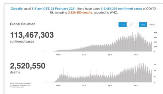
Fig. 1. Number of Cases of Covid-19 [2].

Concerning the number of cases, data published in real-time and updated continuously can, of course, be referred to the dashboard page of WHO, an agency under the United Nations (UN) which is indeed mandated to deal with the world health problem, including Covid-19. The authors have captured a graph of the development of the spread of Covid-19 cases from the beginning of its appearance until Monday, March 1, 2021, at 12:07 Jakarta time (see Graphic 1). It is clear that globally confirmed cases have reached 113,467,303 people, with 2,520,550 died. By and large, since the beginning of the spread of Covid-19, the graph has been steadily climbing, both for the number of confirmed cases as well as the number of fatalities.