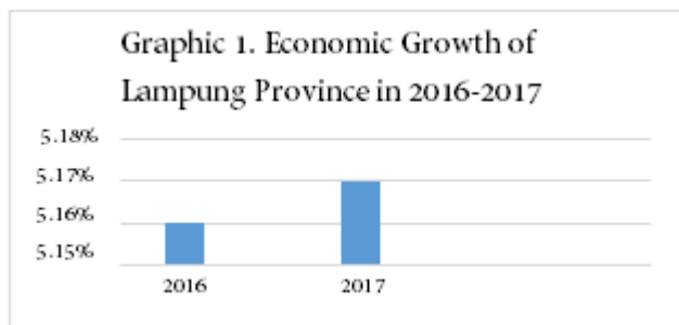
Figure 1. The economic growth of Lampung Province between 2016-2017

Lampung Province ranked fourth as a region with high economic growth in Sumatra [3]. The Strategic Plan of the Lampung Province Tourism Office for 2015-2019 will develop tourism as a potential sector, considering that this area has various tourism potential, i.e., natural tourism, artificial tourism, agritourism, and cultural tourism. Policy related to agritourism is the Decree of the Minister of Agriculture No.357 / KPTS / HK.350 / 5/2002 regarding plantation business licensing guidelines. Article 1 point 9 stipulates "that plantation tourism after this referred to as agritourism, is a form of activity that utilizes plantation business as a tourist attraction to diversify the business, expand employment opportunities, and promote plantation business".