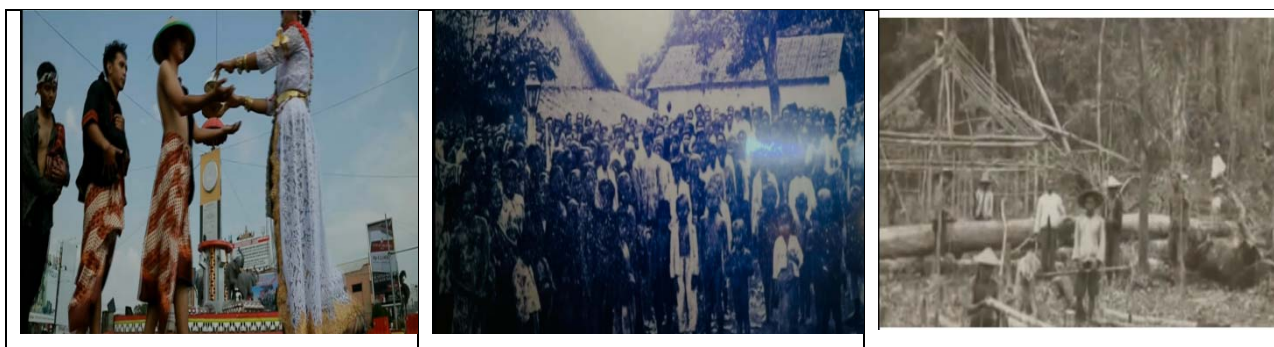
Figure 1. Display of documentary Based Local History Learning Media

The last stage of designing the event of local history learning media is making a media program script. The manuscript is formed supported by the fabric that will be taught to students written within the sort of a documentary. Furthermore, after the design stage is complete, media production is administered. The assembly stage is administered by entering the fabric that has been compiled within the Storyboard into the pc. The resulting data is then integrated with the Adobe Premiere Pro program. In any case, these processes are complete, the subsequent step is on the disk drive or CD. The CD will later function as a medium for learning local history.