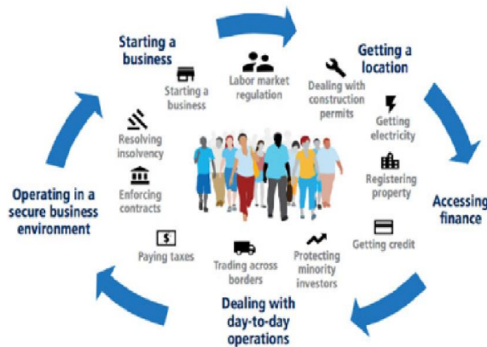
Fig. 1. Flowchart: Business Ease of Assessment Indicators

Regarding the ease of doing business in countries in the world, the World Bank has 5 (five) stages in doing business, including starting a business, getting a location, accessing finance, dealing with day-to-day operations, and operating in a secure business environment. The five stages are broken down into 11 (eleven) indicators used to map the effectiveness and quality of business regulations, which consist of starting business, labor market regulation, dealing with construction permits, getting electricity, registering property, getting credit, protecting minority investors, trading across borders, paying taxes, enforcing contracts, and resolving insolvency. Thus, in the description above, the assessment of ease of doing business can be drawn below: