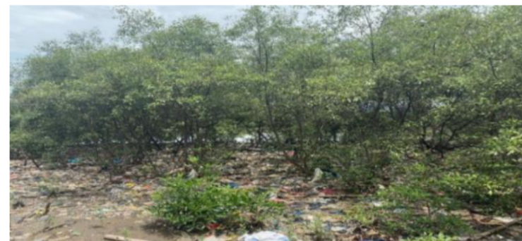
Figure 4. Waste problem at mangrove sites

In 1993, one of the NGOs, Walhi (Indonesian Forum for the Environment), attempted to plant mangroves, but the efforts were unsuccessful. Because of the loss in mangrove area caused by mangrove logging due to the construction of roads and bridges to support the growth of the Karang City area, notably Pasaran Island as a port center, planting has been expanded again since 2015. Walhi's participation was followed by several non-governmental organizations, including Akar Foundation, Tangan and Mahusa Foundation, describing the potential and participation of stakeholders in saving Karang City's mangrove forests.