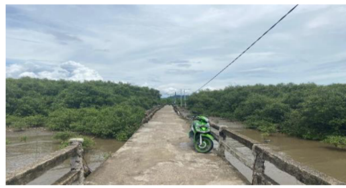
Figure 3. Mangrove logging for bridges between regions

In 1990, the Bandar Lampung City coast had a mangrove ecology that almost completely encompassed the entire coastline (an area of 59.35 ha). Mangroves in Bandar Lampung City have degraded as a result of increased population and development, leaving only a few hectares in Karang City, namely: in 2012, the mangrove area of Karang City was 4,007 ha, in 2015 it was 3,589 ha, in 2017 it was 4,668 ha, and in 2019 it was 5,478 ha. Karang City has a population of 10,186 people, with 2,642 households as family heads. Fishermen, construction workers, and entrepreneurs/traders provide the majority of the people's income. The income level of each family head is at a low-income level. This level has an impact on securing low-paying occupations and affects settlement patterns. As a port area, Karang City serves as a crossing point to Pasaran Island. The problem of waste and the construction of facilities and infrastructure for the port area and towns also threaten the existence of mangroves, because they are built on a mud substrate where mangrove habitats are located.