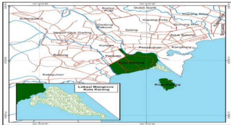
Figure 1. Research location

Karang City Village is one of the villages in Bandar Lampung's Teluk Betung Timur District, with a 35-hectare land area and a shoreline (coastal area). Bandar Lampung City, the capital of Lampung Province, is located on the coast of Lampung Bay and has experienced rapid population expansion and development. With a population of 1,000,000 (million), Bandar Lampung City has a land area of 19,722 ha (197.22 km 2 ), divided into 20 sub-districts and 126 urban villages.