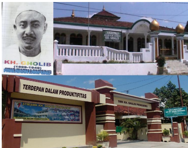
Figure 1 K.H Ghalib Jami Mosque and Pesantren in Pringsewu