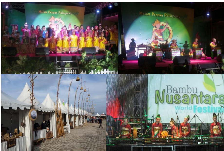
Figure 4 Cultural Events in Pringsewu

Supporting cultural industries in Lampung Province, Pringsewu is chosen being host for the 8th and 9th Bambu Nusantara Festivals which is annual international events of Economic Creative and Tourism Ministry (Figure 4). It was held from May 15th to 16th 2014 and then in November 29th - 30 th 2015 at Pringsewu Government Field. Events is opened to all various of performance including folk dance, folk music, traditional dance group, modern dance and traditional icon culinary. This festival features various product and attractions to develop and highlight bamboo as local potentials of Pringsewu identity. The cultural festivals attract culture tourist to local community events, have contributed in the development of cultural tourism. Festivals have major impacts to promote the local potentials and the host communities. The local government as well private sectors and society in general have responsibility for tourism development and promotion to global market.